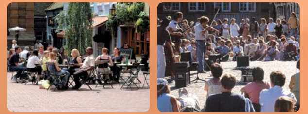
Flexible open spaces for events, markets and cafe spill outs