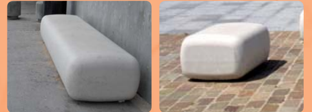
Feature benches in key locations within the public realm