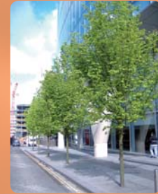
Street Tree planting