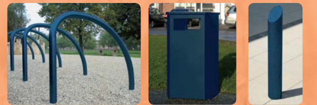
Co-ordinated palette of street furniture