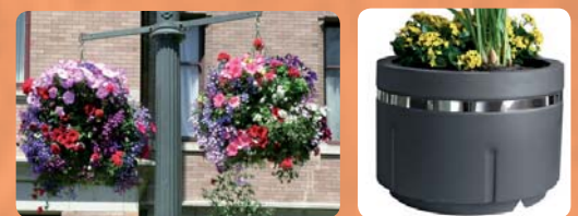
Greening up the streets with hanging baskets and planters