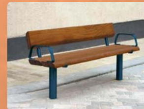
Seats with arm and back rests