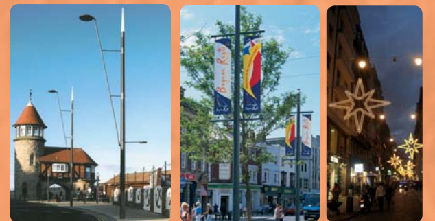
Light columns with fixtures for banners, hanging baskets and festive lights